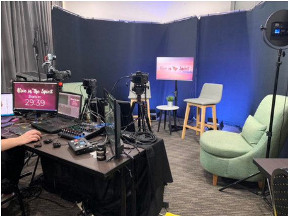
It was the Alive in the Spirit 'Morning Show' feel!