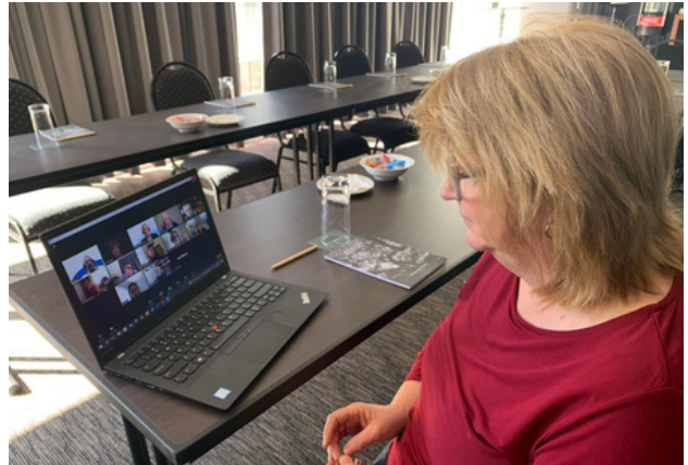
Carmel participating in one of the group sharing opportunities.