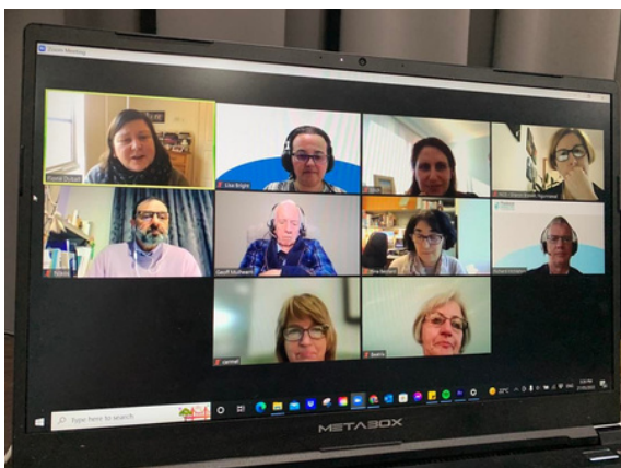
One of the many group sharing opportunities.