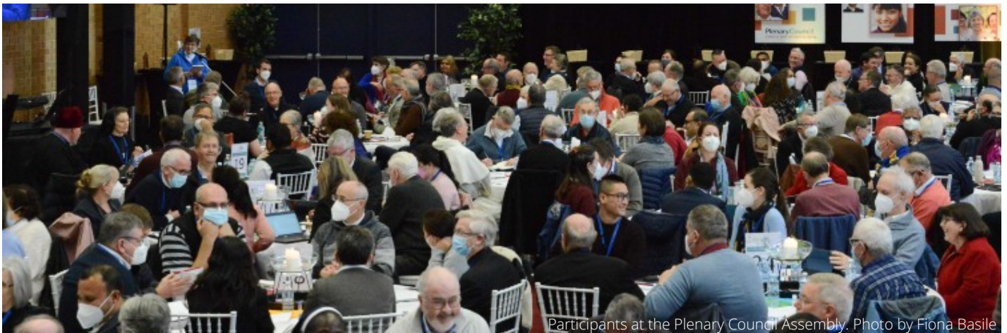
Participants at the Plenary Council Assembly.

We acknowledge the traditional custodians of the lands on which we minister and all who have contributed to our story.